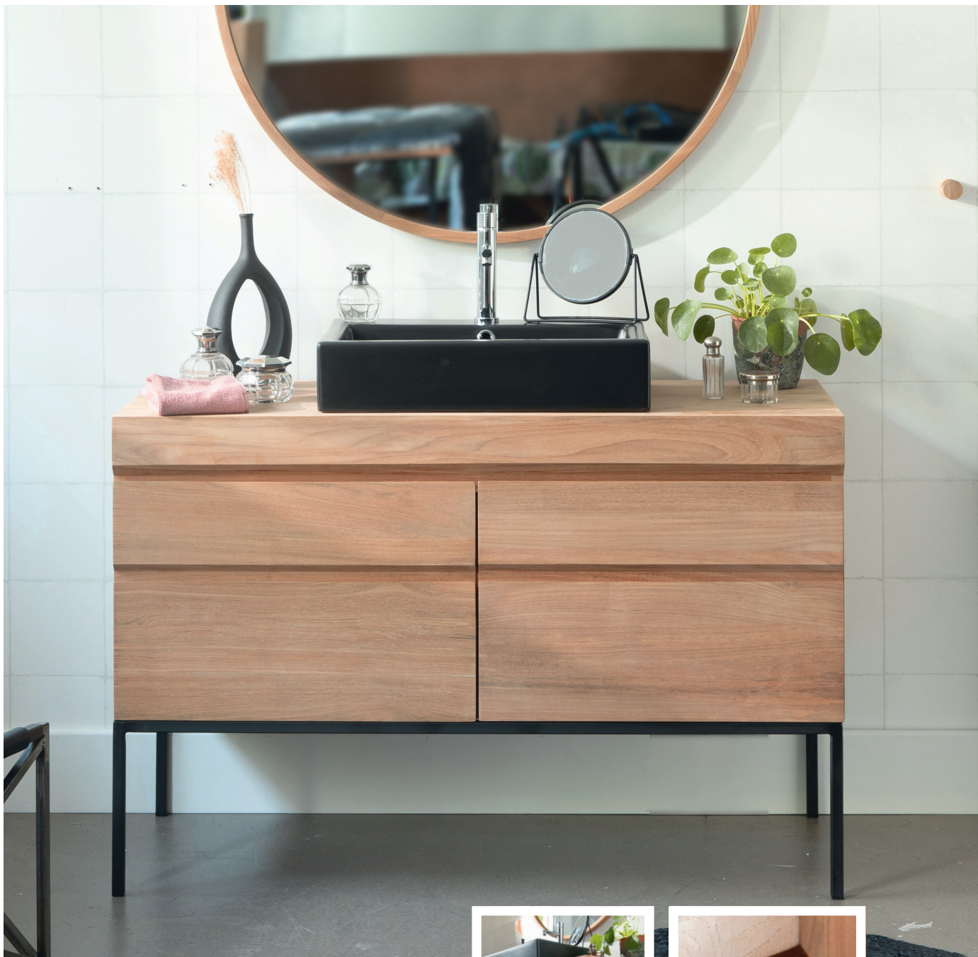
Natural teak finish