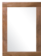
L 60 x H 70 x D 3cm Ref. 3.00.071 MR