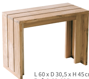
L 60 x D 30,5 x H 45 cm Ref. 2.02.025