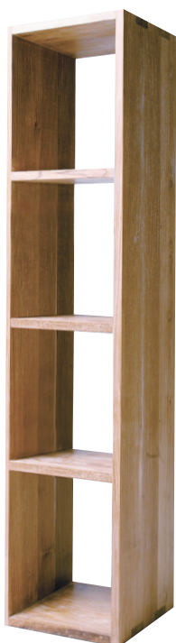
SHELF L 45 x D 45 x H 200 cm Ref. 2.04.600