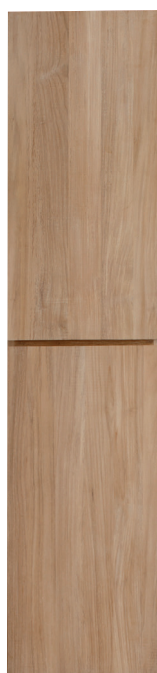
WALL HANGING COLUMN 2 DOORS L 40 x D 36 x H 180 cm Ref. 2.04.620