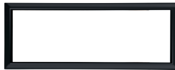
STAINLESS STEEL WALL BRACKET IN BLACK/PAIR P 52 x H 20 cm Ref. 5.70.013-BM