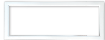
STAINLESS STEEL WALL BRACKET IN WHITE/PAIR P 52 x H 20 cm Ref. 5.70.013-WM