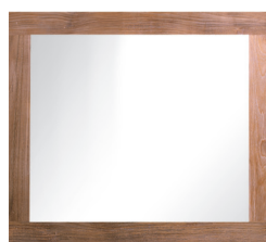
L 90 x H 90 x D 3cm Ref. 3.00.072 MR