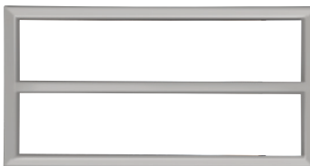
STAINLESS STEEL WALL BRACKET/PAIR P 52 x H 27 cm Ref. 5.70.012