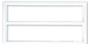
STAINLESS STEEL WALL BRACKET IN WHITE/PAIR P 52 x H 27 cm Ref. 5.70.014-WM