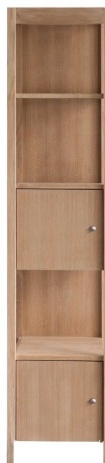
2 DOOR COLUMN L 40 x P 40 x H 180 cm Ref. 2.04.320