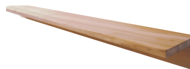
Max L 200 x D 15 x H 7 cm Linear meter Ref. 2.03.100