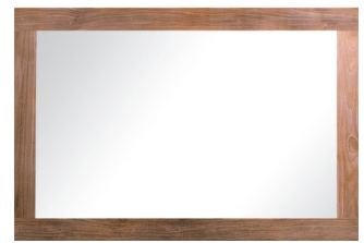
L 120 x H 90 x D 3cm Ref. 3.00.073 MR