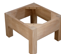
BASE (optional) for Ref. 2.04.620 L 40 x D 36 x H 25 cm Ref. 2.04.621

Natural teak as per price list. Optional oiled finishes +15%.