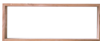
WALL STORAGE L 65 x D 15 x H 25 cm Ref. 2.03.104