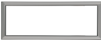
STAINLESS STEEL WALL BRACKET/PAIR P 52 x H 20 cm Ref. 5.70.011