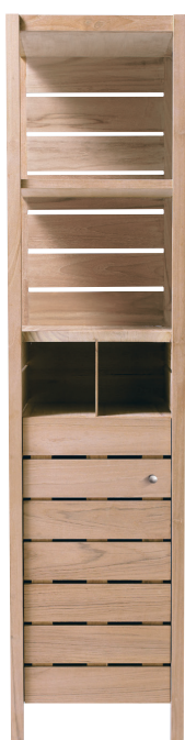
1 DOOR COLUMN L 42.4 x D 40.8 x H 187.8 cm Ref. 2.20.020