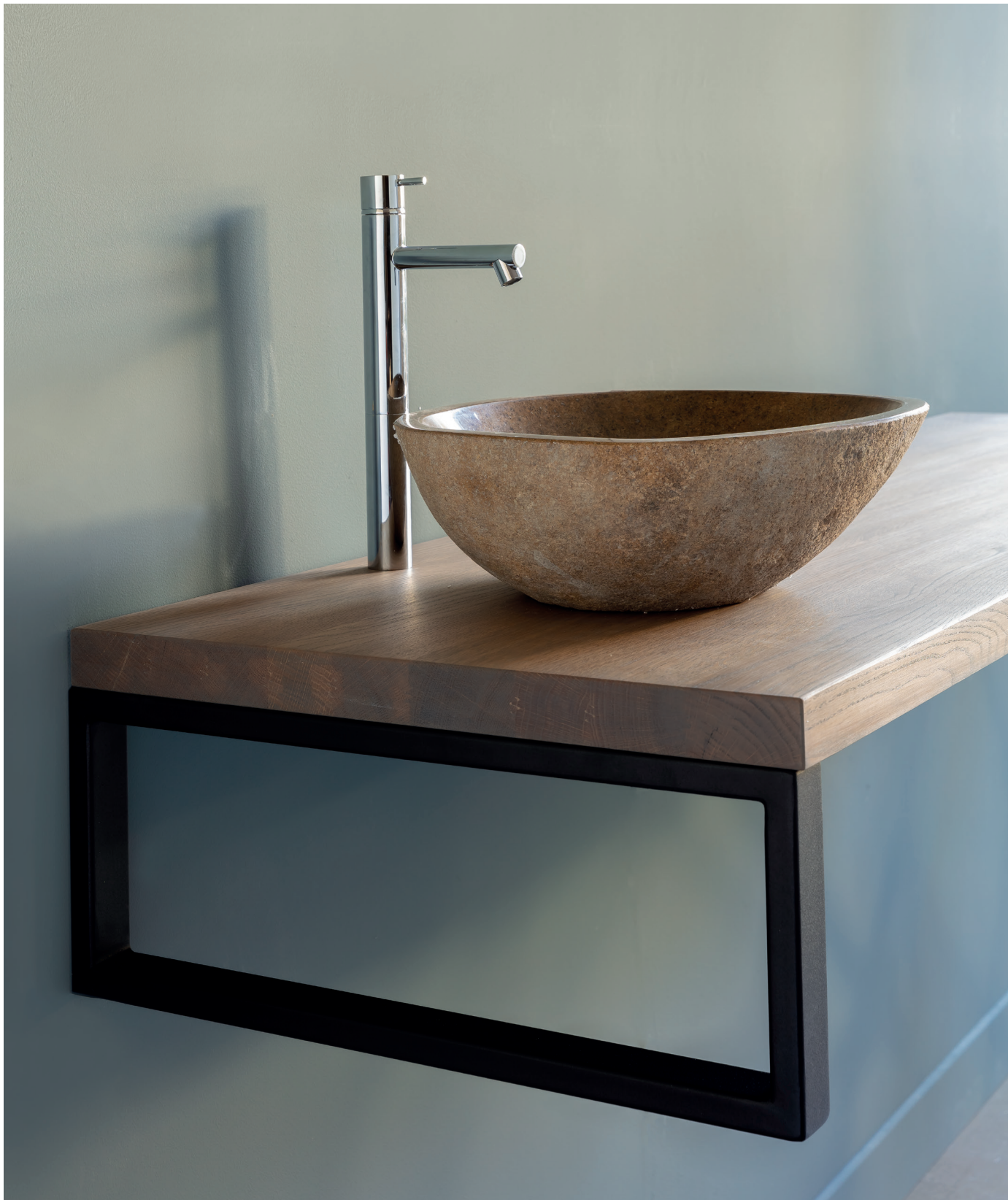
Natural oil finish