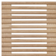
FLAT HANDLE Ref. 2.50.005 ATR