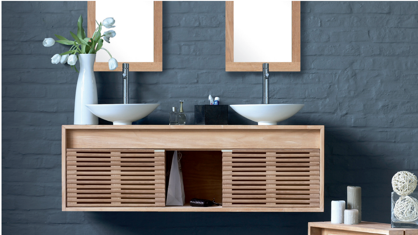
Natural teak finish