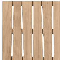
FLAT OR ROUND HANDLE Ref. 2.50.005 ATB