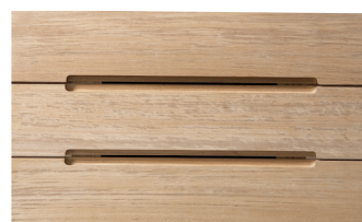
WITHOUT HANDLE Ref. 2.50.000 BT Ref. 2.50.005 CT Ref. 2.50.015 DT