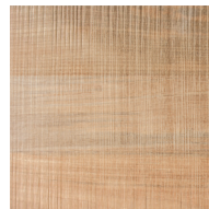
FLAT OR ROUND HANDLE Ref. 2.50.005 ATT

Natural teak as per price list. Optional oiled finishes +15%. Stainless or matt black handles (see p105)