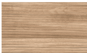
FLAT HANDLE Ref. 2.50.000 BTS Ref. 2.50.005 CTS Ref. 2.50.015 DTS