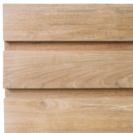
WITHOUT HANDLE Ref. 2.50.005 ATSL