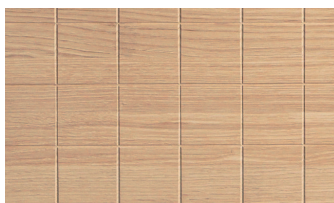
FLAT OR ROUND HANDLE Ref. 2.50.000 BTO Ref. 2.50.005 CTO Ref. 2.50.015 DTO