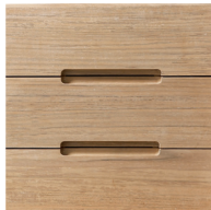
WITHOUT HANDLE Ref. 2.50.005 AT

SUITABLE FOR REFERENCES: 2.50.005, 2.50.010, 2.50.100 – L 30 X D 2 X H 30 CM