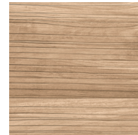
FLAT HANDLE Ref. 2.50.005 ATS