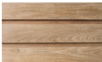
WITHOUT HANDLE Ref. 2.50.000 BTSL Ref. 2.50.005 CTSL Ref. 2.50.015 DTSL