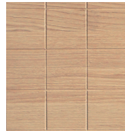
FLAT OR ROUND HANDLE Ref. 2.50.005 ATO