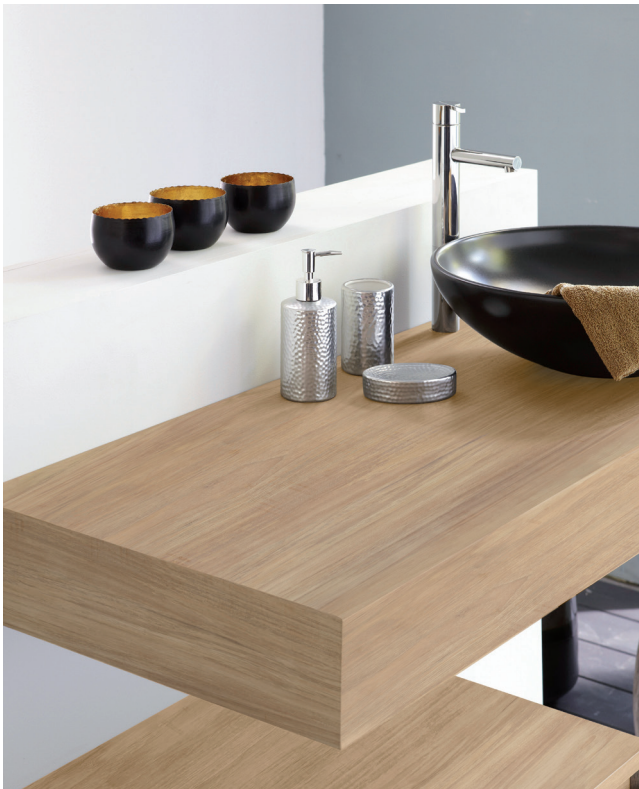
Natural teak finish