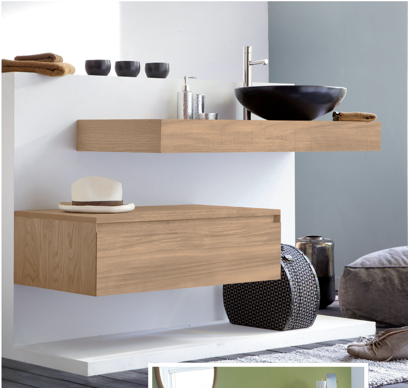
Natural teak finish