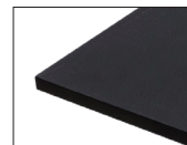
BLACK SOLID SURFACE