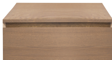
STORAGE UNIT WITH 1 DRAWER L 75 x D 30 x H 25 cm Ref. 5.59.510 OAK TOP INCLUDED