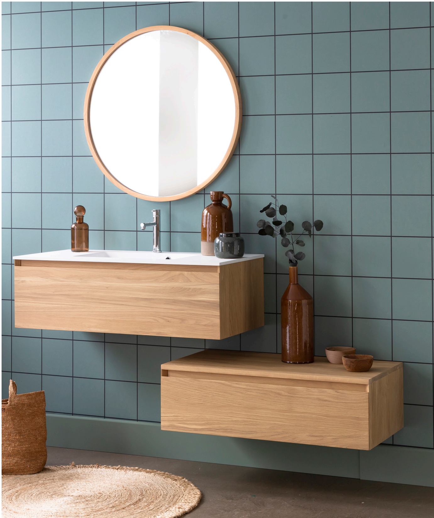
Natural oil finish