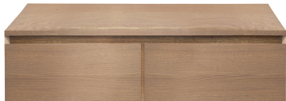
STORAGE UNIT WITH 2 DRAWERS REMOVABLE STORAGE INCLUDED L 120 x D 45 x H 27 cm Ref. 5.59.515 OAK TOP INCLUDED