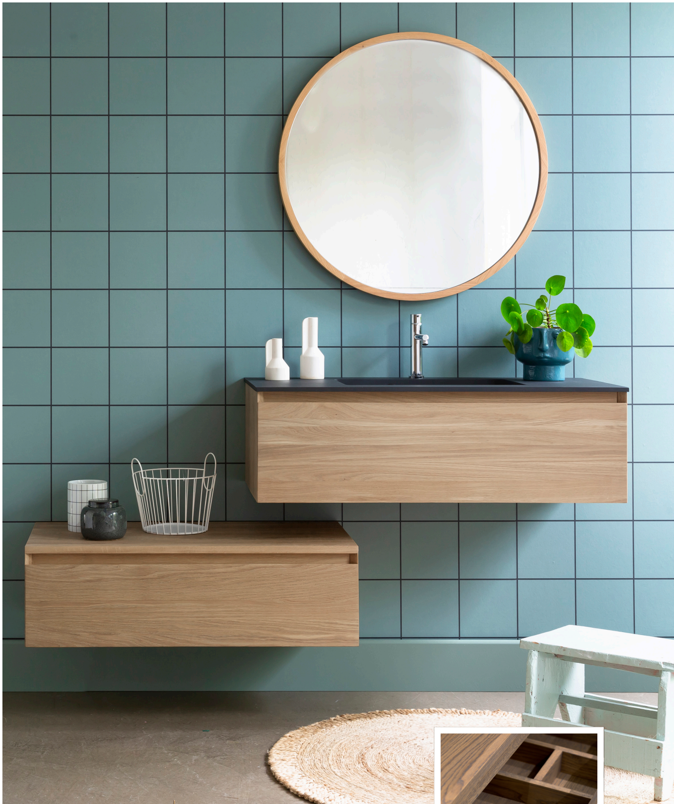
Natural oil finish