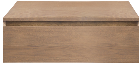
STORAGE UNIT WITH 1 DRAWER REMOVABLE STORAGE INCLUDED L 90 x D 45 x H 27 cm Ref. 5.59.500 OAK TOP INCLUDED